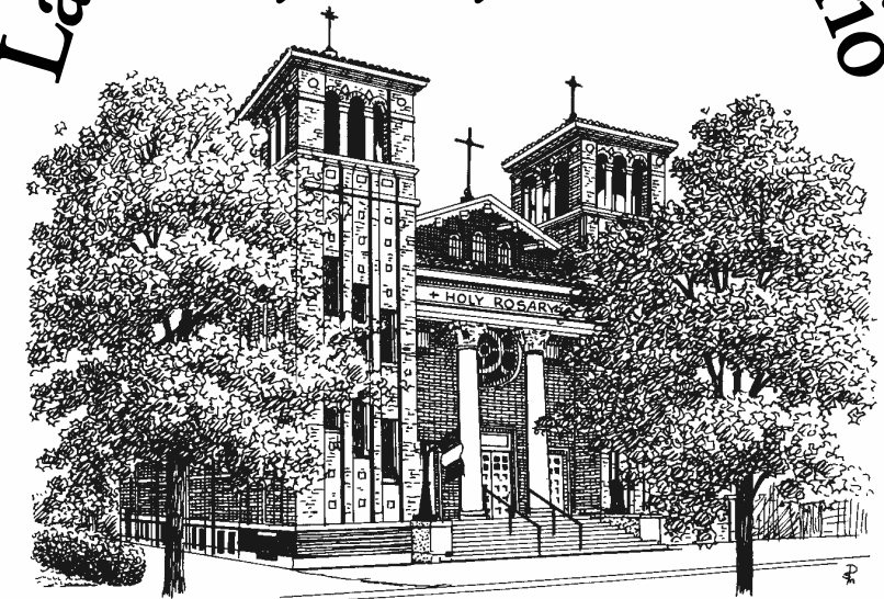
The Italian Parish of Indianapolis